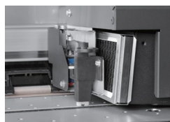
Built-in automatic media cutter