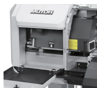
Easy access maintenance area

The VJ-1638UR Mark II improves maintenance operations and provides users easy replaceable cleaning wiper, mist filters, etc. Built-in automatic media cutter increases work efficiency.